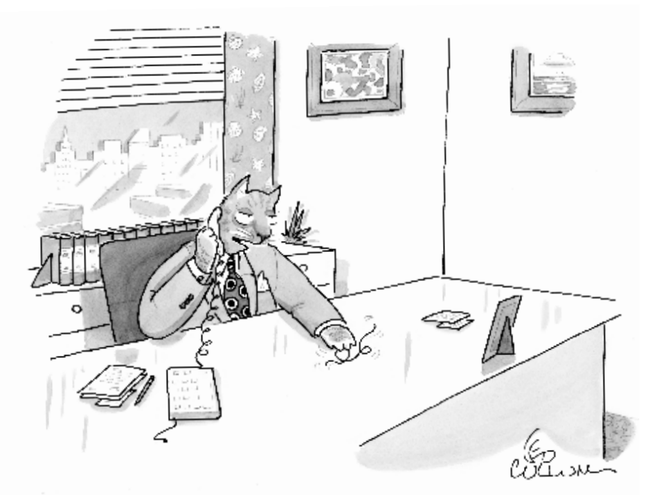
"Can I call you back? I'm with a piece of string."

soldier with one tourniquet; we use a miniratchet strap that is one inch wide and long enough to wrap around the thigh of a soldier. Cotton holds water. Even with the best socks, and plenty of foot powder, your feet are likely to start peeling like you've never experienced. You're more likely to be injured by not wearing a seatbelt than from enemy activity. You need to train your soldiers to aim, fire, and kill. The average local is terrible at trying to read a map; however they do understand sketches-the simpler the better. The second you see your soldiers start to lose interest, or roll their eyes, or not pay attention, your S2 has failed and you, your soldiers, and the mission are in danger. Vary the departure and return times, vary the routes even if the route includes a U turn, doesn't make sense, etc. Let's talk about what not to bring: perishable food, lighter fluid, porn, alcohol, or personal weapons. But you might be able to get away with a Playboy or two as long as you're not stupid about it. The 9mm round is too weak, go for headshots if you use it.