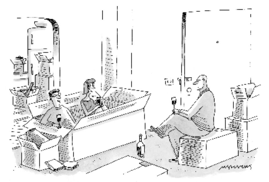
"We're still moving in."

The problem with both CALL and the I.E.D. Task Force is that their information is as unidirectional as "The Mailing